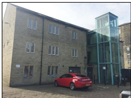
Warehouse No 4

Hebble Suite 68.07m 2 (733 sq ft) Calder Suite 57.66m 2 (621 sq ft)