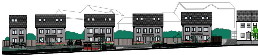
STREET SCENE FROM WHITEHALL ROAD